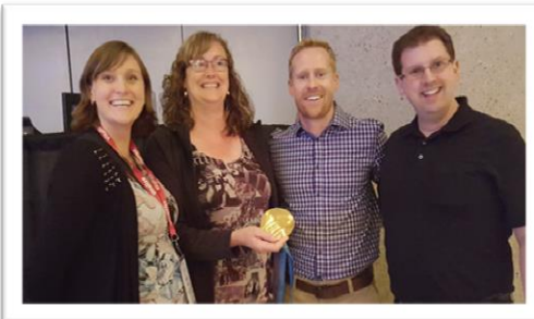
VMPC Board members met Jon Montgomery, Vitalize closing Keynote speaker, Olympic Gold Medalist and Host of The Amazing Race Canada.